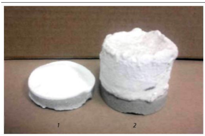
Figure 2. Filtration cake of clayless solution which is not weighted (1) and weighted by barite up to the density of 1820 \text{kg/m}^3 (2), after measuring at T = 140 °C and P = 5 MPa

To increase the density of clayless rinsing fluid possible by processing with water-soluble salts. By this method of weighting its possible to violate the ratio between the colloidal and solid phases, and thus eliminate the key reason of the packing filtration multiplication.