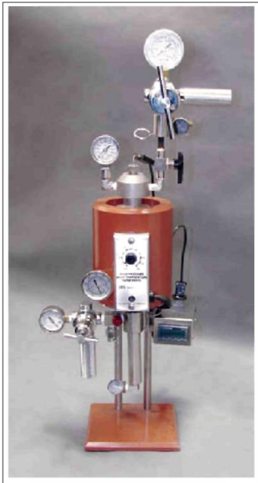
Fig. 1. Tester for determination of packing filtration (tester HPHT)

It is found that, in the result of the introduction of relatively small amounts of barite (35 % to volume), which corresponds to the density of 1270 \text{ kg/m}^3 , packing filtration steps up to the limits of the technically acceptable values, and further increase of the density of rinsing fluid its packing filtration continues to grow and rapidly reaches immeasurable quantities in which filtered out almost all the volume of the liquid phase. Of course, such level of packing filtration makes impossible a performance of this type of rinsing fluid in these thermal conditions, since it leads to a deepening of volume filtration peel, which in the interval of bedding permeable can reach sizes capable of creating significant barriers boring tool movement (Fig 2).