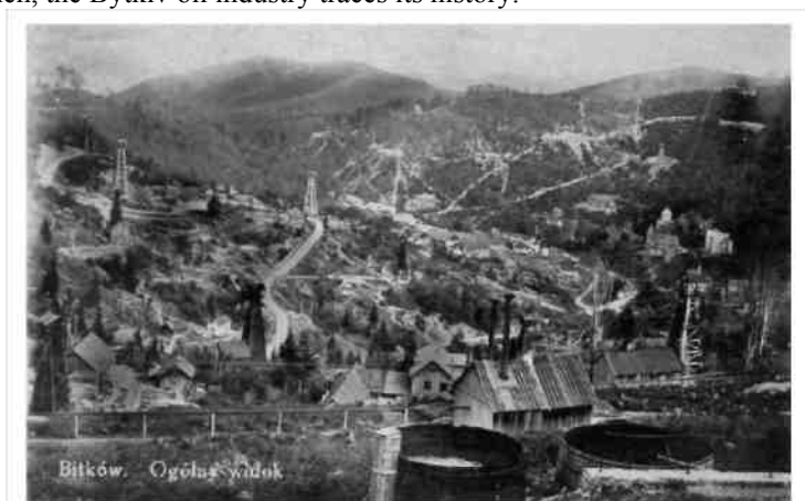
Fig. 2. General view of Bytkiv oil field

digging of wells here in places of oil manifestation on the surface in 1859, and in 1872 the first well was drilled here. The implementation of drilling at great depths allowed discovering the new fields; the first oil-bearing well was drilled in Bytkiv in 1899. Since then, the Bytkiv oil industry traces its history.