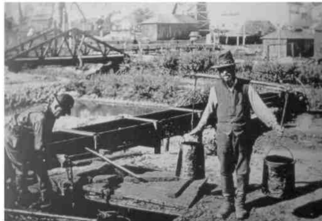
Fig. 1. Manual oil collection

The beginning of the industrial oil production in the region is believed the year of 1771. At that time in the village of Sloboda-Rungurska at Kolomyia district the oil was received from the well dug for the extraction of salt at the depth of 24 m. Subsequently, such wells for oil production (or oil cistern) began to appear in the other parts of the Carpathians, i.e. in the village of Ripne (1786), in the village of Naguyevychi (1792), near Boryslav (1820's) etc. with the time passing by the oil reservoir got exhausted, so the wells were deepened. Currently their maximum depth is not established, but this method of production was dangerous to the miners. Frequently the rock falls, explosions of natural gas, and equipment falling caused injury to or even death of employees. One of these cases was described by the famous Ukrainian writer Ivan Franko in his story Boryslav Laughs.