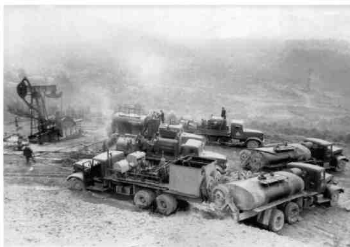
Fig. 3. Measures to increase the oil production (1970's)

First the wells were drilled by manual impact way, and later they began to use the mechanical impact drilling using the steam engines (locomobiles). The foreign methods were widely implemented in fields, gradually improving and adapting them to geological conditions of the Carpathians. For example, the Polish-Canadian drilling method appeared this way.